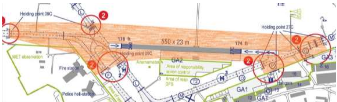
Schematic representation of the runway safety area of runway 27C/09C

The runway safety area of runway 27C/09C covers large parts of the taxiways Mike, Foxtrot, Lima and Golf. On these taxiways, pilots will find the common markings for holding points even if they cannot see the physical runway here. A runway safety area must NEVER be crossed without a clearance. If pilots have not received an explicit clearance to cross, they MUST stop and hold under all circumstances. Crossing a runway holding point without a clearance, means you have entered the safety area of an active runway.