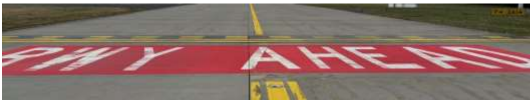
Holding point marking with special hot-spot-designation

All holding points that have shown themselves to be critical because of past occurrence investigations have been identified as hot spots in the AIP charts and have additionally been marked with a red RWY AHEAD bar on the ground.